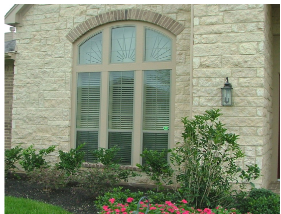
Blackout Arches with Street Side Backing (Decorative look)