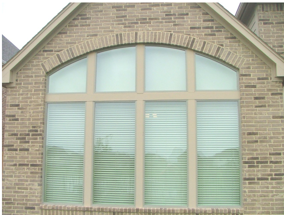
Blackout Arches without Street Side Backing (Solid look)